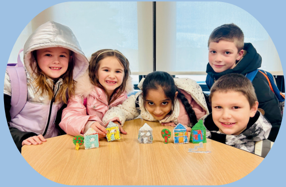
Second grade students in the after-school 3D Printing Program built a S.T.E.A.M. City!