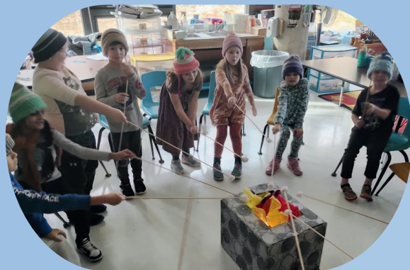
2nd graders sparked creativity by building a cozy fireplace for reading and roasting marshmallows!