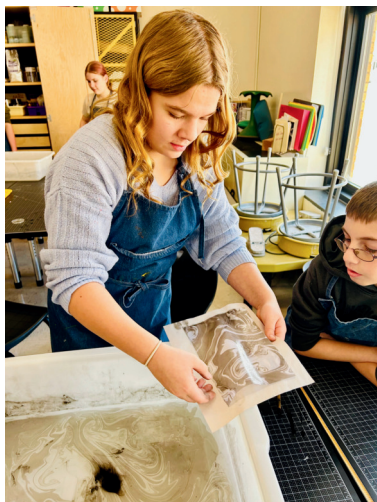
Students in Mrs. Winter's elective classes had fun learning the traditional Japanese art of Suminagashi, creating their own marbled paper!