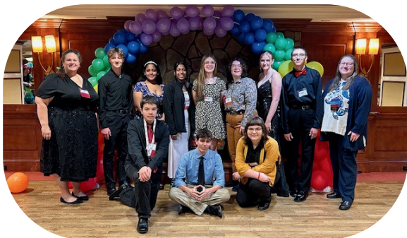
Tri-Valley Theatre Club members and advisors refined their theatrical skills at the NYSTEA Annual Conference!