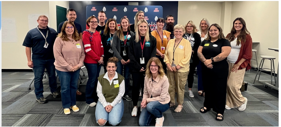
On November 1st, Tri-Valley staff took part in a Youth Mental Health First Aid training led by the Empowering a Healthier Generation (EHG) Team.